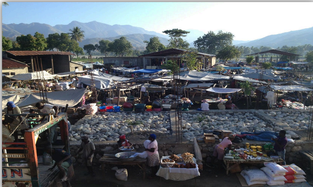
The market at Les Anglais, Haiti

The mission of John 6:35 Ministries is to spread the good news of Jesus Christ to the people of Haiti using a marketplace evangelism model and to provide impoverished Christ-followers with job training, employment, and business ownership opportunities.