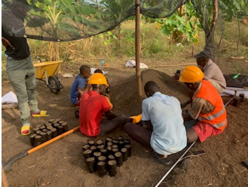
Planting mango trees, LaCohaune, Haiti (January 2021)

The mission of John 6:35 Ministries is to spread the good news of Jesus Christ to the people of Haiti using a marketplace evangelism model and to provide impoverished Christ-followers with job training, employment, and business ownership opportunities.